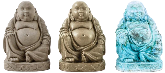
Printed Sanded & Polished Patinated